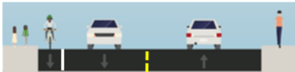
Roosevelt to I-10